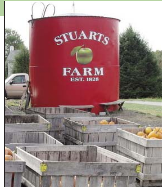
Mimi Edelman's I & Me Farm, as well as Stuart's Farm, were on the tour.

Our Local Land/Local Food Farmers Network provides us with a new framework for protecting land that is both beautiful and valuable, and which provides local residents with local food. ▲