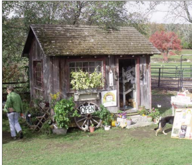
Kitchawan Farm in Yorktown was a participant in our chefs tour.

meetings in the winter, so people could share ideas and advice. Almost 100 people have participated.