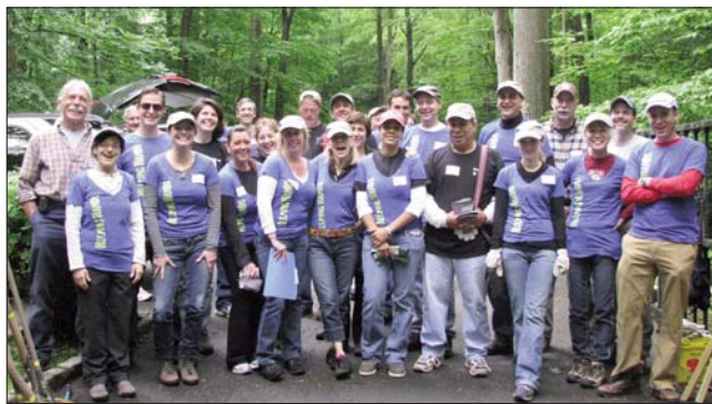
The Swiss Re and C. W. Brown crews made big improvements at two preserves and a local school.