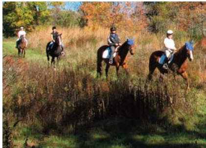
Riders at the Gaymark Preserve

We at Westchester Land Trust are proud that we've protected an enormous amount of land with various partners from around the county and the state.