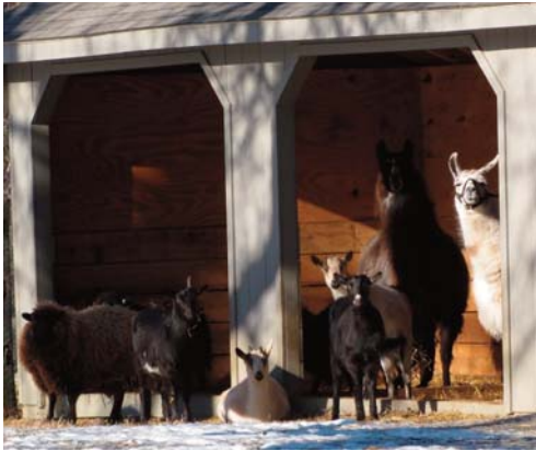
Farm animals at the Mancini easement

happen in 20 years, or 50, or 100. If an organization ceased to exist, their lands would be protected by the conservation easements. Likewise we're preparing conservation easements on our lands to give to